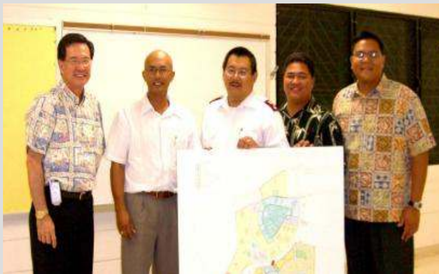
Presenters of the planned Kroc center with Senator Espero

Located just northwest of Ewa Villages, it could be open by 2010.