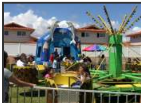
Parents, children, and residents gathered to the Our Lady of Perpetual Help church's Family Fun Fair in Ewa Beach on March 3, 2007.