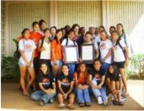
The Junior Varsity and Varsity Girls Soccer team displays their pride in their accomplishments with big smiles