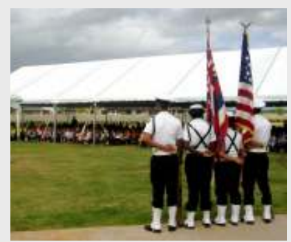
Members of JCHS's JROTC team were chosen to perform Color Guard duties at the dedication ceremony for Keone'ula Elementary School.