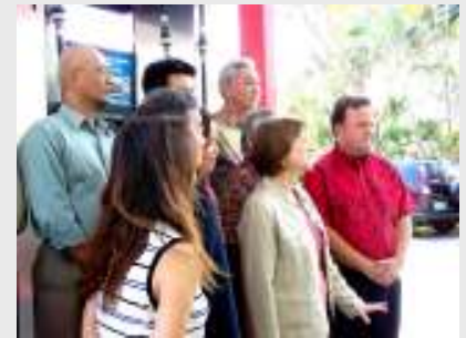
Democratic Senators united to speak in favor of an Ethanol tax break that restores an 11-cent-per gallon tax break on ethanol-blended gasoline.