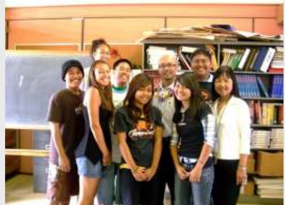
All of these students when asked about their after high school plans had responded with prospects to attend college. People with Bachelor degrees take home over 98% more lifetime pay, on average, than non-college graduates.